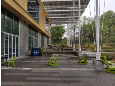
Steps toward Ferst Drive

4b. If the side entrance is closed, or if you need access to the main entrance, turn right and go up the steps to the street (Ferst Drive). When you reach the street, turn left and you will see a gray brick wall. Walk toward that wall and the main entrance will be on your left, also like a wooden box.