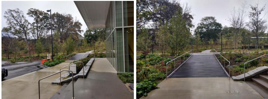
Path to follow

2. Walk straight. You will go on a wooden bridge that leads into a concrete path on the park area (the Eco-Commons). Follow that path uphill. You will see the Kendeda Building on your left.